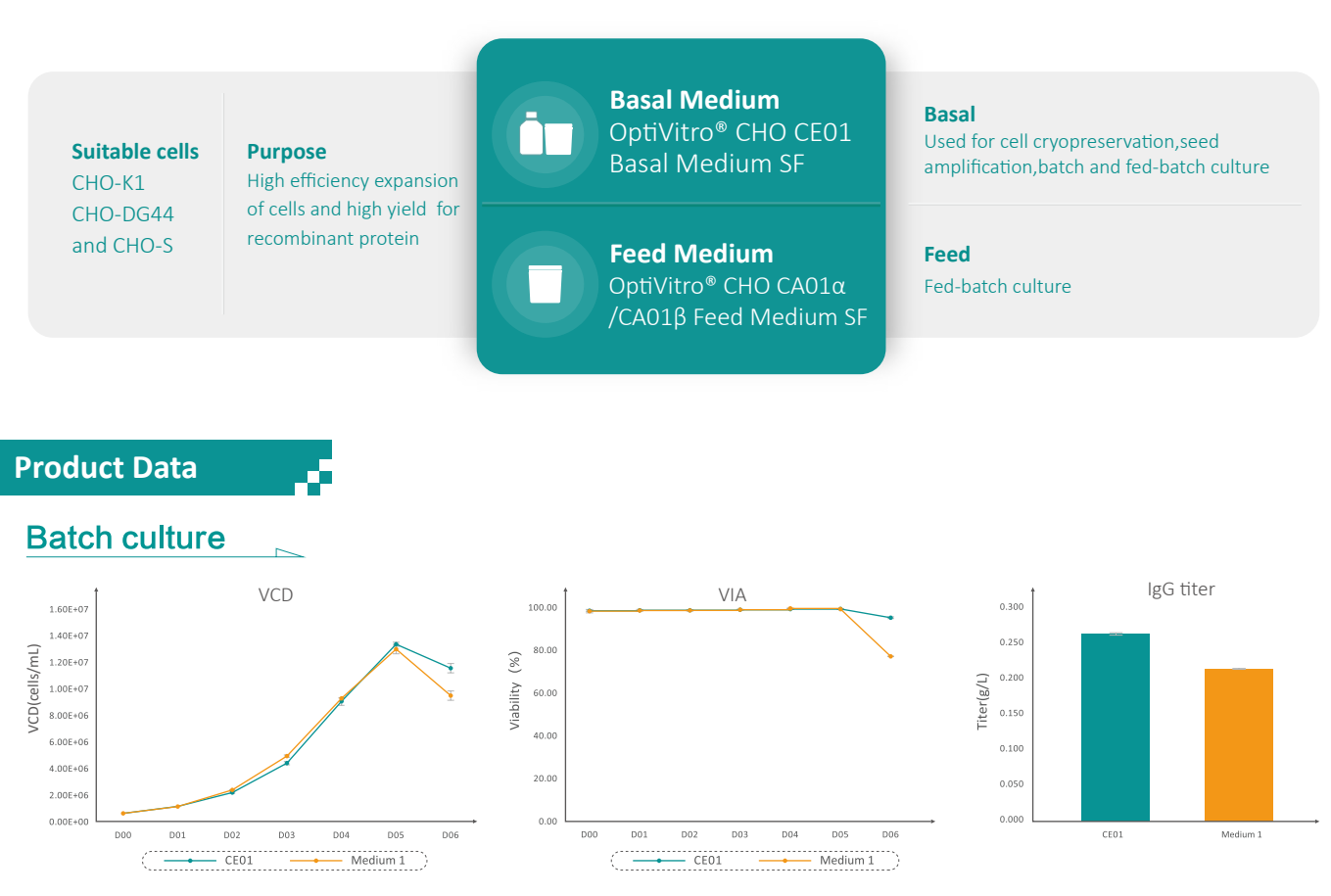
Figure 1. Cell viability , density and IgG titer of OptiVitro<sup>®</sup> CEO1 and Medium 1 cultured in batch culture for 6 days Cell line: CHO-K1